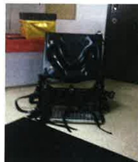
Geri-Chair with lock table