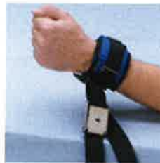
Velcro Wrist Restraint