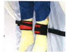
Velcro Ankle Restraints (red)