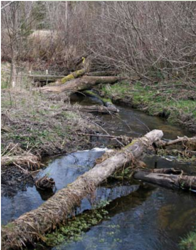
The entire area is protected as an ecological preserve.