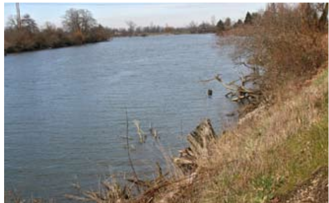
The completed project, a short distance down the road, is now fully vegetated and looks entirely natural.