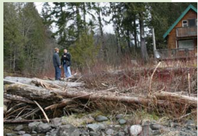
In the background stands one of the Hiddendale properties protected by the project.

“The typical approach before we did this would have been to line the banks with riprap, using the same size material we used in the groins,” said Latham. “The thing is, when you go that way, currents accelerate along riprap, and you’re just sending the problem downstream. You don’t get any improved habitat or channel diversity. It’s just a rock wall. With these three small groins, it didn’t establish a big footprint, but it’s really kept the thalweg, or the main part of the river, well out beyond the bank, preventing any further erosion. It also created all this habitat in between each groin. Now the bank has been stabilized as well or better than riprap ever could do it.”