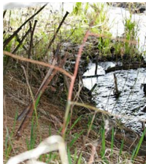
Coir matting and planted vegetation stabilize the creek banks under the bridge.