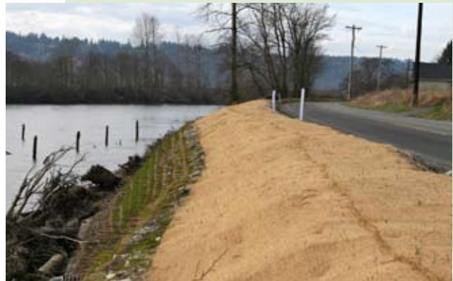
Eventually the coir fabric and the structural earth wall itself will be completely overgrown with hydro-seeded grass and other vegetation.

“Overall, this type of design will require less ongoing maintenance than riprap,” said Lucas. “It secures the riverbank against erosion, and it helps to meet our commitment towards maintaining salmon habitat, a stated goal of Snohomish County. When we can add those elements together and stabilize a County road in a habitat friendly manner, I think the project speaks for itself.”