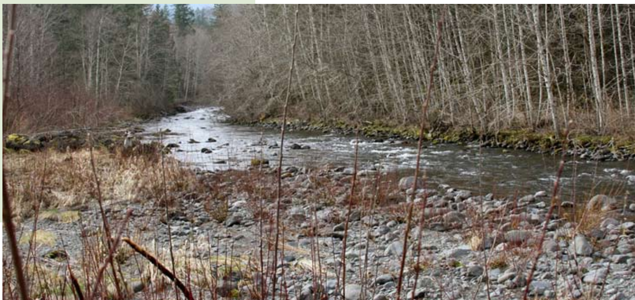
Planted willows, dogwoods, conifers and other trees will create a mat of roots to help stabilize the riverbank.

The first step in installing the groins involved temporarily blocking the river from entering the construction site. Since the project was undertaken while the river was at a seasonally reduced level, only a small area had to be coffered off with sandbags. Once the construction site was secured, three trenches extending 25 feet back into the bank were dug, and tapered down into the river channel. Multi-sized rocks similar to that used in riprap design were then carefully layered into the trenches.