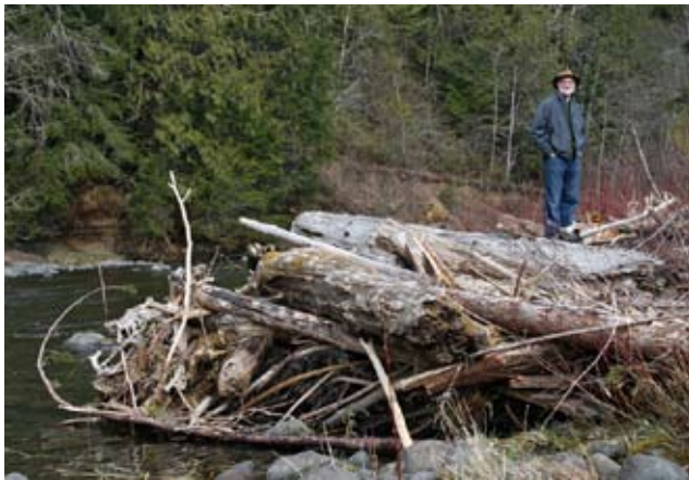
Al Latham stands on top of one the groins extended into the river.

The National Forest Service donated almost forty 25 to 30-foot long logs, several with root wads still attached, which the Forest Service retrieved from areas of blow-down during previous storms. The logs were laid within the trenches, several logs to a trench, with the root wads sticking out into the river. To lock the structures in place, the logs were integrated with the rocks. Additional rocks were then piled on top of the logs, giving the structures strength and stability.