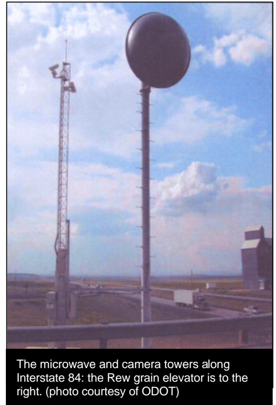
The microwave and camera towers along Interstate 84: the Rew grain elevator is to the right.

http://www.tripcheck.com/RoadCams/roadcams.htm