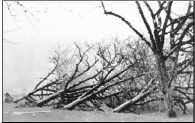
Uprooted trees caused by a freak northeast gale bringing a great dust storm to Oregon, April 1931

It was the same all over Portland that Tuesday night. First the sky took on a yellow-red tinge; then, abruptly, winds of around 50 miles per hour began to blow. Witnesses described a huge coppery cloud that swept out of the Gorge and down on the city, spreading like a giant fan... (by Sunday it was calculated that) over three million pounds of dust had fallen on the city, enough to fill 33 freight cars... Portlanders maintained that ‘the very palpable atmosphere even tasted like turnips’... In McMinnville, a Linfield College student calculated that 48,400 pounds of dust had fallen on every square mile of land in the vicinity each day for three days.