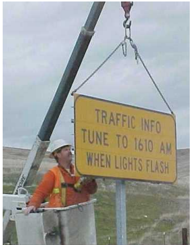
Highway Advisory Radio System installed in northeast Oregon by a member of the ODOT District 12 sign crew: the signs advise motorists to tune to 1610 AM for traffic information when the lights on top of the sign are flashing. The system was installed to service an area known for blowing dust hazards and icy roads in winter, and as part of the Chemical Stockpile Emergency Preparedness Program (CSEPP), which paid for the radio system. ODOT installed the signs and transmitters, and will maintain the system.

ODOT has installed two gates for I-84 closures as recommended by the Community Solutions Team that met in early 2000. The gates were also funded by CSEPP. The gates are not across the freeway itself, but rather at on-ramps. There is one at the eastbound I-84 on-ramp at exit 165 (Port of Morrow, just east of Boardman). The other is on the westbound on-ramp at exit 202 (Barnhart Road, just west of Pendleton). State and local law enforcement officers and ODOT highway workers can close the gates, restricting access to I-84 due to hazardous dust conditions or other situations that make highway travel dangerous.