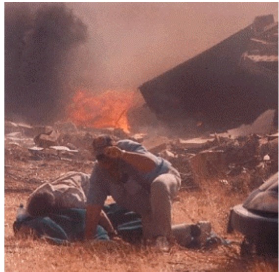
Dust storm traffic crash on Interstate 84, Saturday, Sept. 25, 1999

Lead: OEM Support: OSP, ODOT Timeline: Spring 2006 Resources: existing