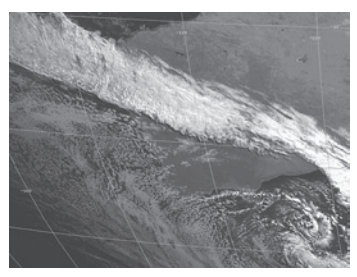
Northwest cloud band

Synoptic weather patterns govern the movement and overall location of icing environments