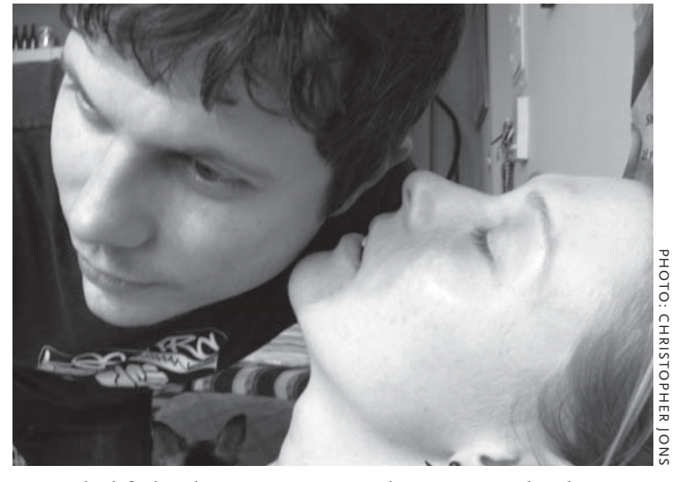
To check for breathing, put your ear near the person's mouth and nose to listen for breath sounds while watching the chest to see if it is rising and falling consistently.