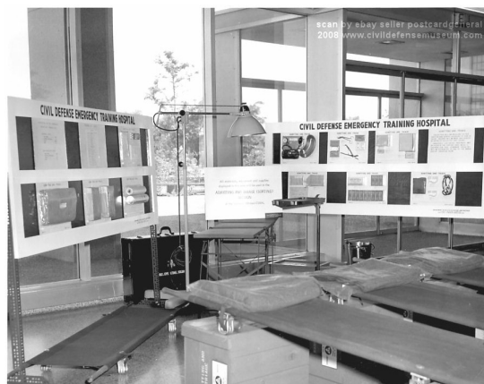
Admitting & Triage Sorting Supplies