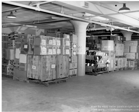
Civil Defense Emergency Hospital packaged, palletized, and stored