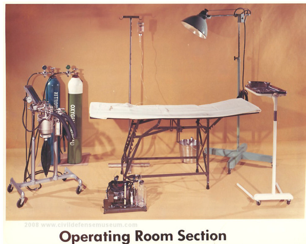
Operating Room Section (details)