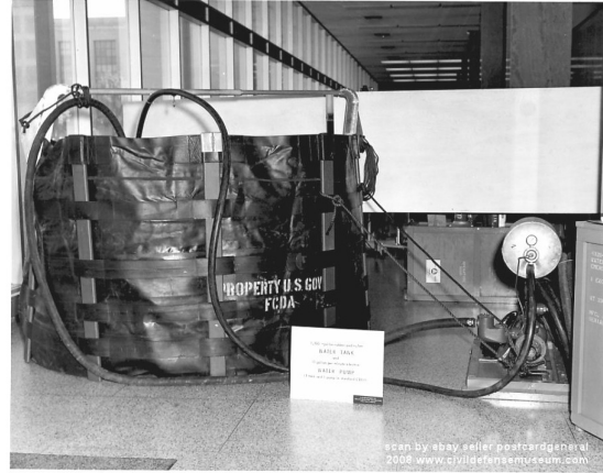
Auxiliary Water Supply