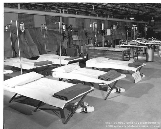
Ward Section [X-Ray and Operating Rooms in background]