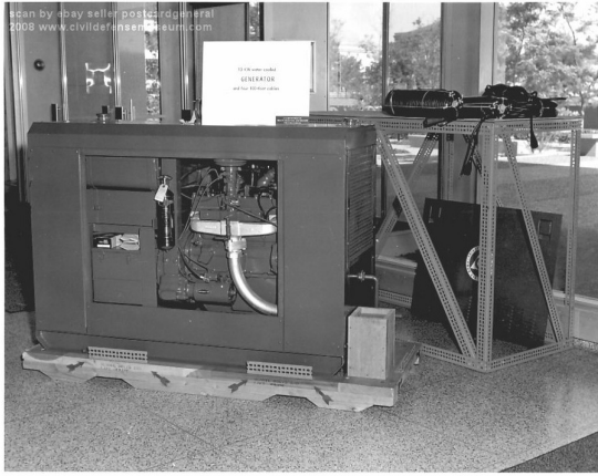
Auxiliary Electrical Generator